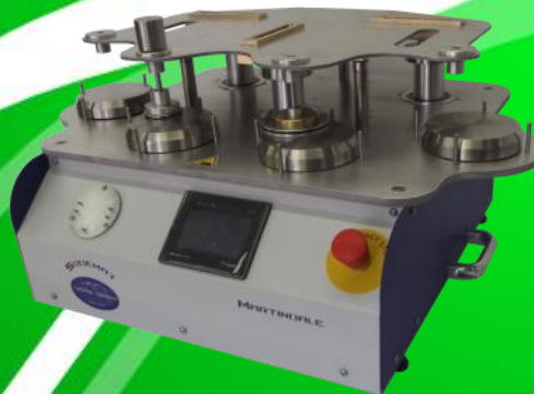
Martindale 4 posts

Type of test: Abrasion and wear Pilling and snagging