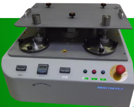
Martindale 2 posts

Commercial reference: SI77-00 - SI85-00 - SI86-00