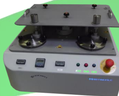
Martindale 2 posts