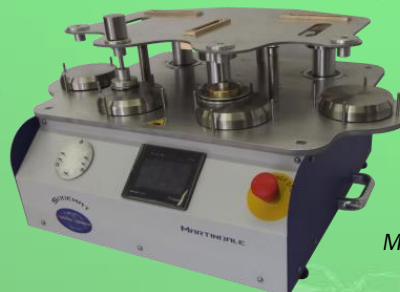
Martindale 4 posts

Version 4 posts with tactile controller for tests management.